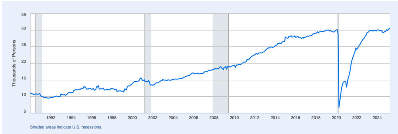
Source: U.S. Bureau of Labor Statistics and Federal Reserve Bank of St. Louis, All Employees: Leisure and Hospitality: Full-Service Restaurants in District of Columbia. 4

employment ever recorded, with over 30,600 workers employed at full-service establishments.