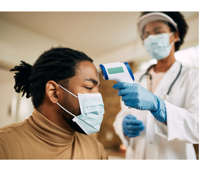
TABLE 1 COVID Infections

During the pandemic, the Centers for Disease Control and Prevention (CDC) named restaurants the most dangerous place for adults to be, and the University of California, San Francisco named restaurants the most dangerous place to work.<sup>24</sup> Tipped restaurant workers who interact most with customers were most vulnerable because they had to interact with high numbers of customers who continuously removed their masks to eat and drink, exposing these workers constantly to an airborne virus even if the workers themselves were masked.